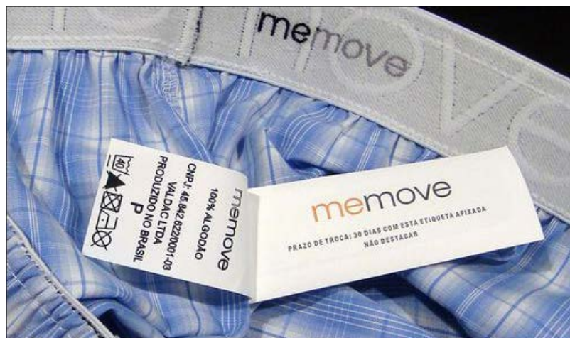
A label with an EPC Gen 2 RFID inlay is sewn into each garment at the factory.

Valdac Global Brands plans to open stores dedicated to its new fashion brand throughout Brazil. Memove targets fashion-conscious consumers between ages and 18 and 25, with the intention of being cutting-edge in its use of technology. For that reason, the first Memove store has mounted screens on which customers can watch music videos or sports games, and also provides Apple iPads for browsing the Internet. In addition, the company wanted to make it possible for customers to easily pay for purchases, without needing to queue up at a counter to wait for a sales associate. The RFID solution makes it possible to purchase apparel quickly, while also ensuring that non-purchased goods